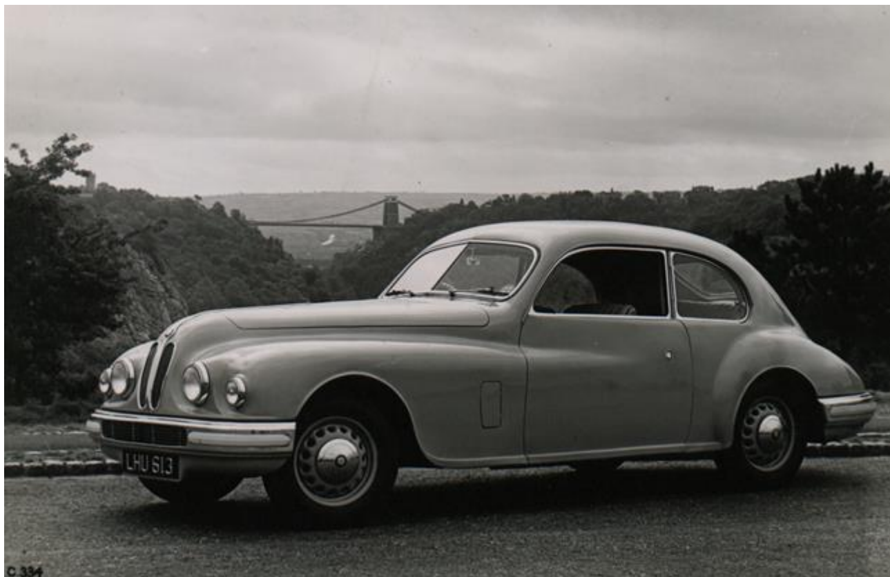
Image: Bristol City Council Public Relations Office photographs, ref. 40826/MOT/2

Bristol Archives holds records of vehicles registered in Bristol between 1904 and 1974. This guide explains what records are available and how you can access them.